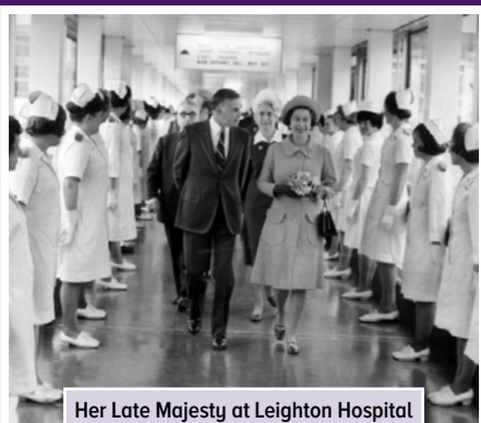
Her Late Majesty at Leighton Hospital in 1972 following its construction

The death of Her Late Majesty Queen Elizabeth II was a huge and sudden shock to us all in Eddisbury, and indeed to all of her subjects worldwide.