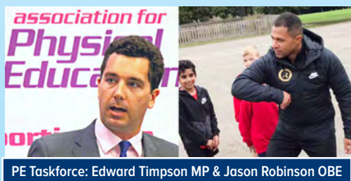
PE Taskforce: Edward Timpson MP & Jason Robinson OBE

"With the right initial teacher training, professional development, funding, and rigour, backed by both inspection and relevant monitoring and evaluation. Then we'll see happier, healthier, and higher-performing kids." ■